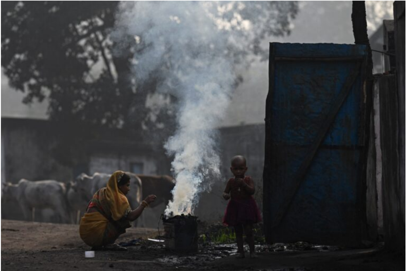
A woman along with her child burns coal for domestic use at Singrauli in India's Madhya Pradesh state.

Too many people, so many of them women and girls, will stay powerless. Energy poverty will remain widespread in many countries if current power demand and supply trends hold, leaving communities unprepared to adapt to the changing climate. For example, limited access to cooling at home and work will lower productivity and severely increase the risk of heat-related illnesses and deaths. That will keep billions — particularly women, who are the main users and producers of household energy — cut off from the modern economy.