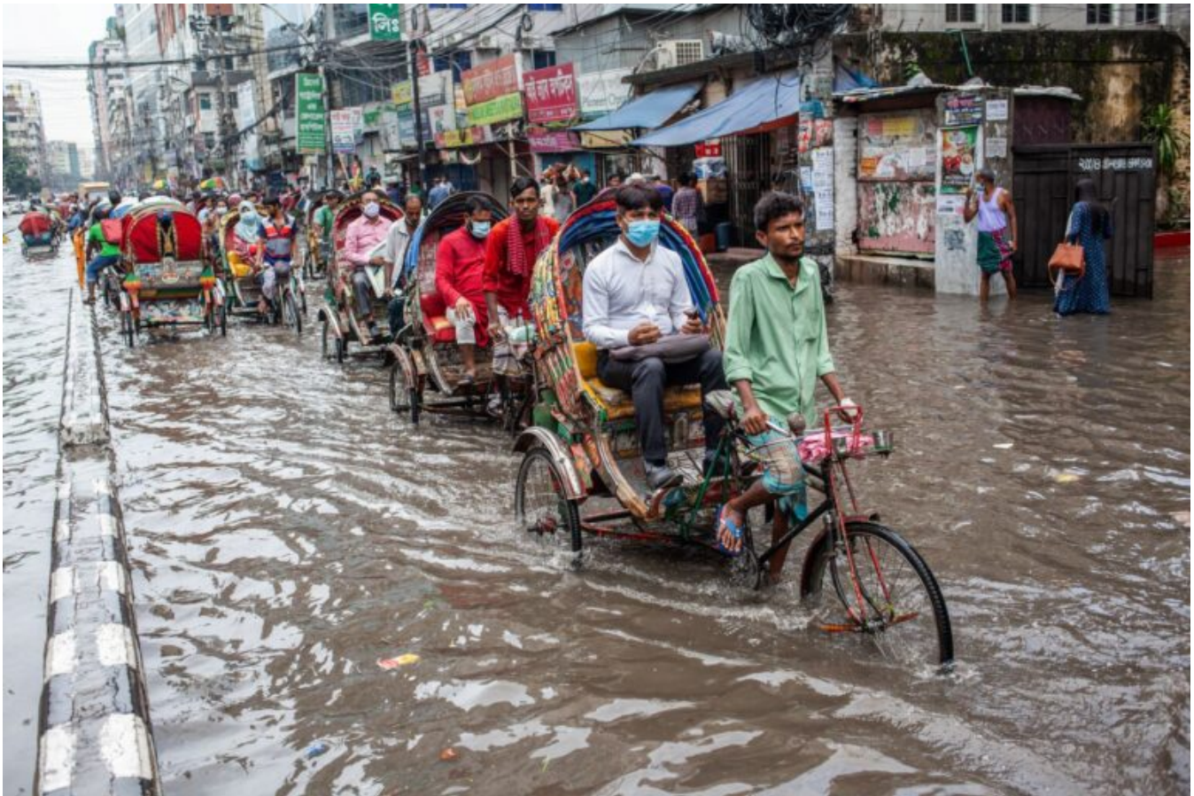
Commuters suffer after Dhaka's Green Road left waterlogged following heavy rains.

Residents of coastal and low-lying communities will lose their homes. Sea levels are projected to rise as much in the next 30 years as they did over the last century. It will be even worse without climate adaptation and mitigation efforts. Coastlines and even some low-lying island states could disappear, leaving millions house-less and many country-less.