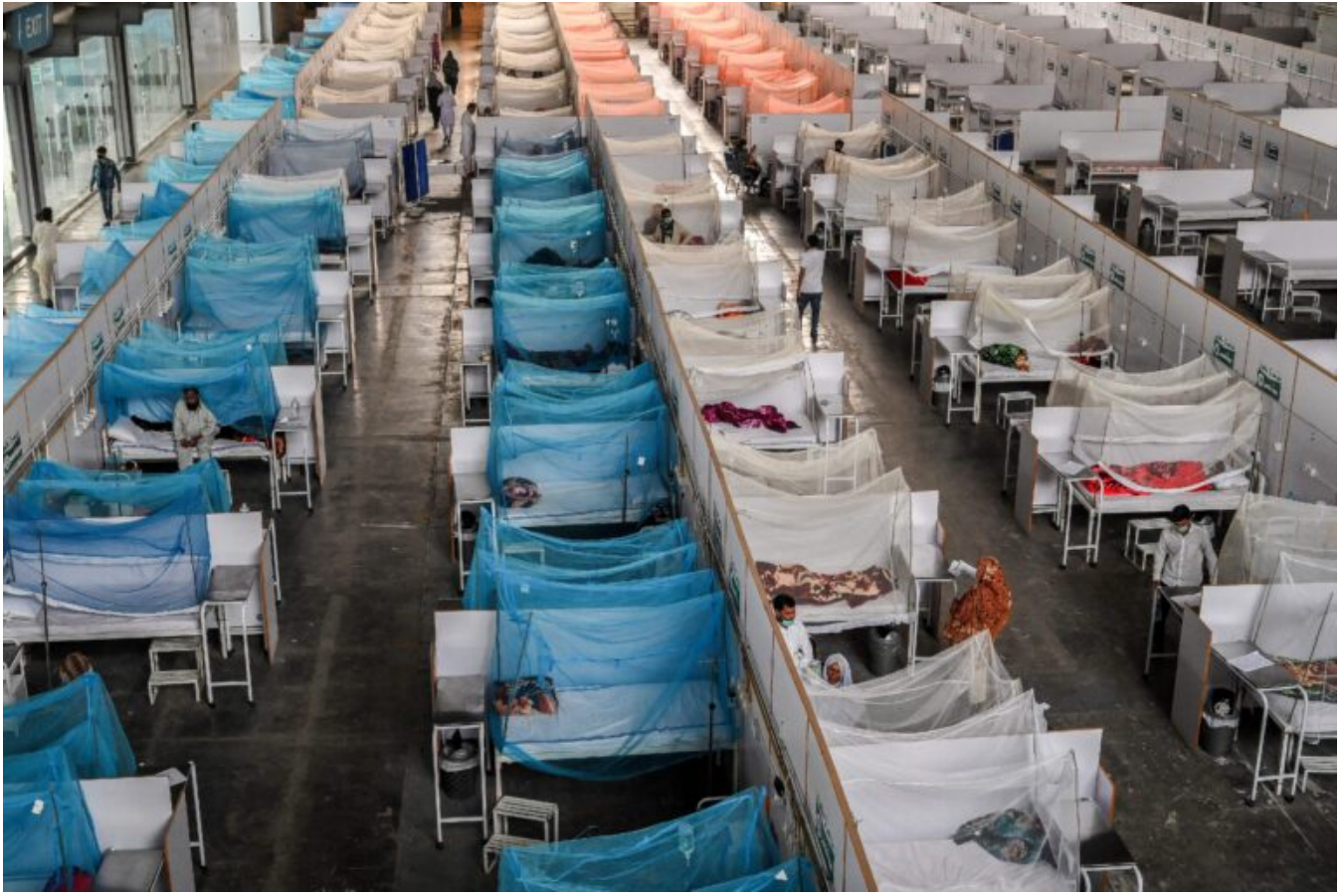
Patients take rest on beds arranged inside a makeshift dengue ward in a hospital in Lahore, Pakistan.

Those with preexisting health conditions will risk dying prematurely. Heat, floods, and food insecurity will make many people more vulnerable in many ways, particularly to death and illness. For example, more than 2.25 billion additional people will be exposed to dengue fever and other diseases.