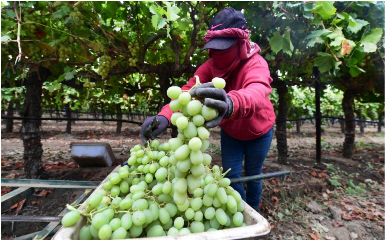
A Hispanic farmworker picks grapes in Lamont, California, where record heat has fuelled drought and wildfires.

And many low-wage workers and manual laborers will lose jobs and work hours. Extreme heat waves and sunny-day flooding events will severely limit labor productivity because people either will not get work or not be able to complete it without access to fans or air conditioning. In the United States alone, reports suggest Blacks and African Americans are 23 percent and Hispanics and Latinos are 43 percent more likely to live where work hours are expected to be lost due to intense heat.