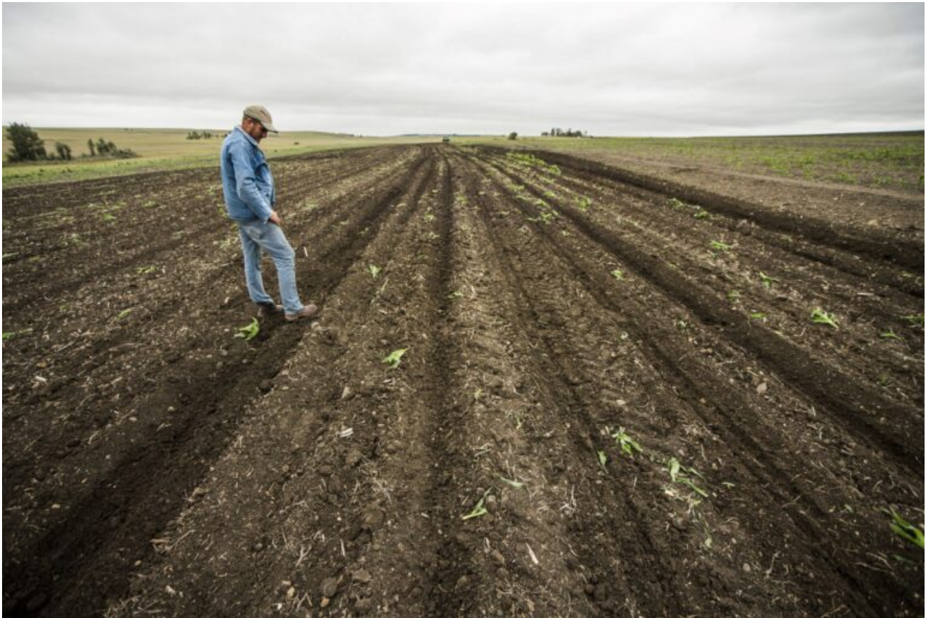
A farmer inspects a ploughed field for the replanting of maize caused by drought in Mpumalanga, South Africa.

Those living in Africa, South Asia, and elsewhere will grow hungrier. Yields of essential crops like maize, wheat, rice, and soybeans will be reduced as growing seasons shift, temperatures rise, and floods and droughts become more frequent. In addition, livestock and fisheries will be lost due to heat stress, shifting, and declining stocks, and extinction. Fisheries alone provide the main source of protein for about 30 percent of Africa's population.